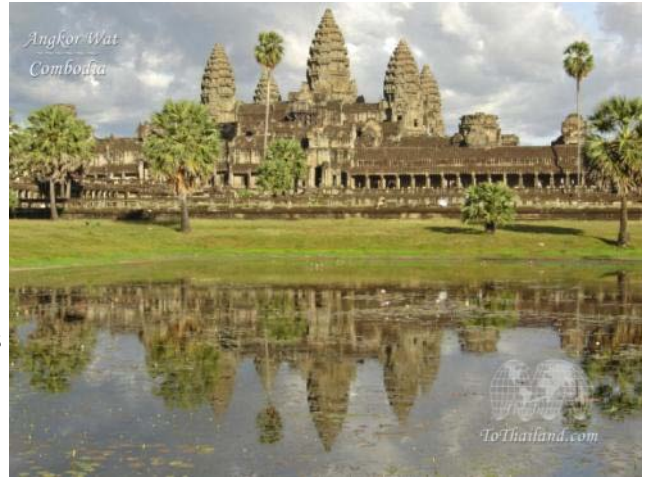
Above: Angkor Wat Cambodia