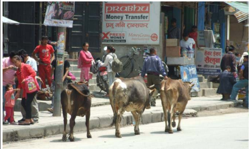
Above - Sacred Cows (Hindu) and Below - Asian Rhinos Royal Chitwan National Park