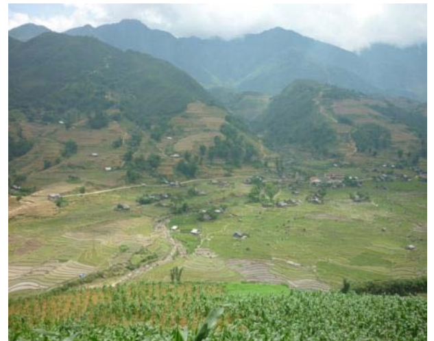
Left: Motorbikes in Sapa & Above: Sapa Paddy Fields

"Before" and "after" photos of the newly-refurbished ITS tea-room. These improvements appear to have been warmly welcomed by all the users and is the latest in the line of official tea rooms we have recently improved (following on those in G, F and A blocks).