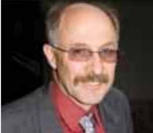
DEAN OF MANAGEMENT