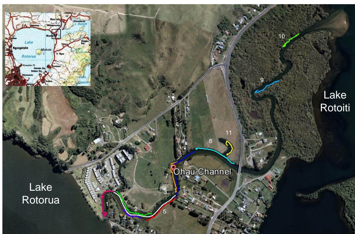
Figure 1. Fishing transects sampled on 9 December 2014 in the Ohau Channel starting from Lake Rotorua and ending at Lake Rotoiti. Site codes correspond to locations in Table 1.