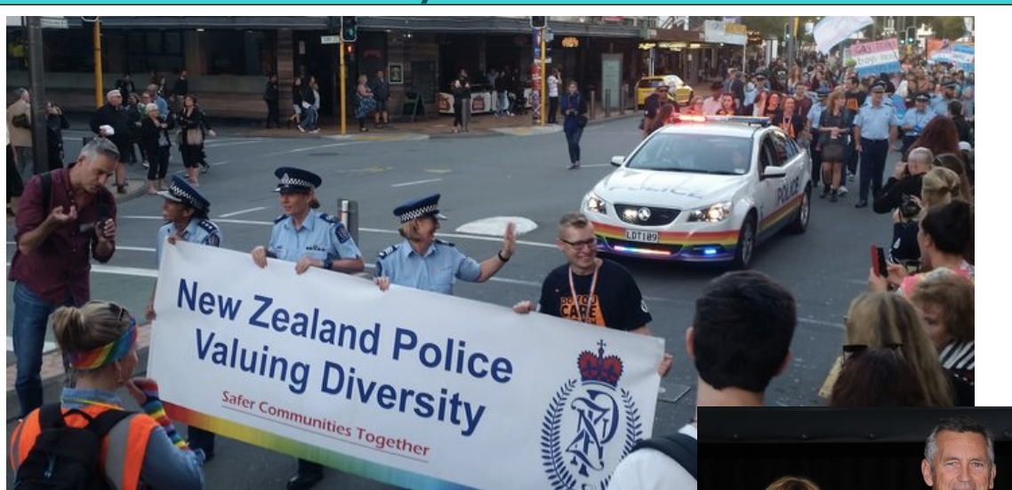
Image: New Zealand Police win Diversity Award

Image: Police at Wellington's Pride Parade