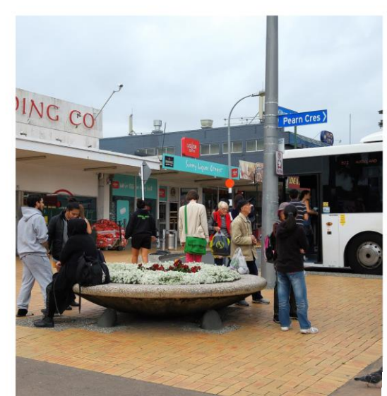
At the bus stop