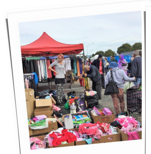
At the market