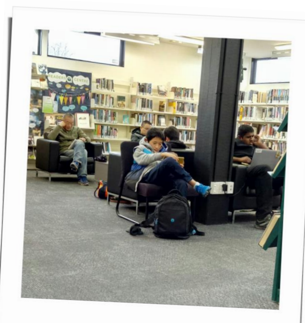
In the library