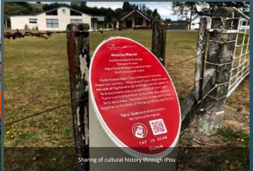
Sharing of cultural history through IPou