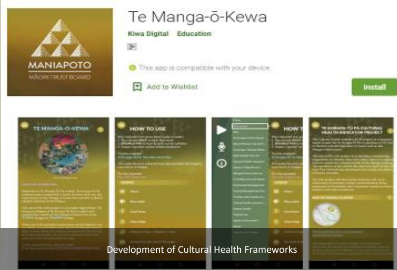
Development of Cultural Health Frameworks