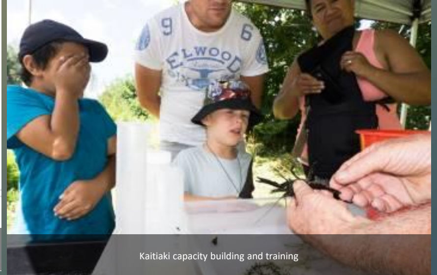
Kaitiaki capacity building and training