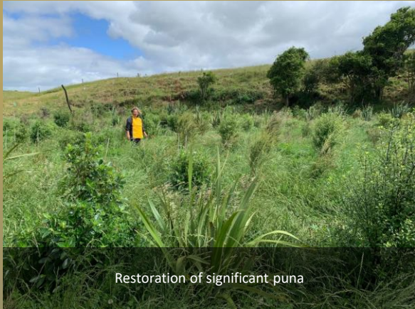
Restoration of significant puna