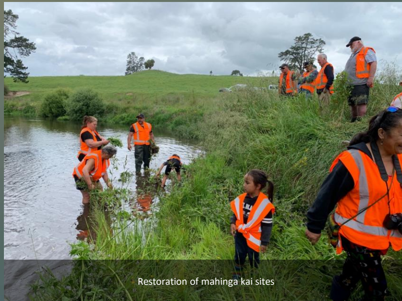
Restoration of mahinga kai sites