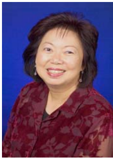
Dr Elsie Ho

In response to on-going shortages of both unskilled as well as skilled labour in New Zealand, the programme has made contributions to the debate about migration from Pacific countries to New Zealand. The Pacific Co-operation Foundation sponsored a conference in late June 2006 on the future of Pacific labour markets and a keynote address was delivered.