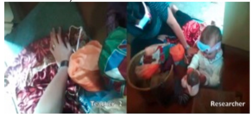
Word + offers object infant initiation x word + touch teacher responses

Teachers placed a great deal of value on infant initiations in their interview, seeing them as the source of pedagogical intervention, or non-intervention because they invited dialogue. As one teacher explained, the significance of these invitations to their overall pedagogical engagement meant that she had to maintain constant vigilance concerning the cues that were being offered and associated judgments about when to respond appropriately: "I'm obviously watching this very closely, and responding to, to carry on that dialogue with him." Teachers also explained the significance of deliberately standing back from initiating dialogue themselves in order to create further opportunities for the infant to convey their priorities, utilising the language forms at their disposal. The following commentary highlights the teacher's vigilance in response to the infant's initiation of offering an object, in this case a doll: