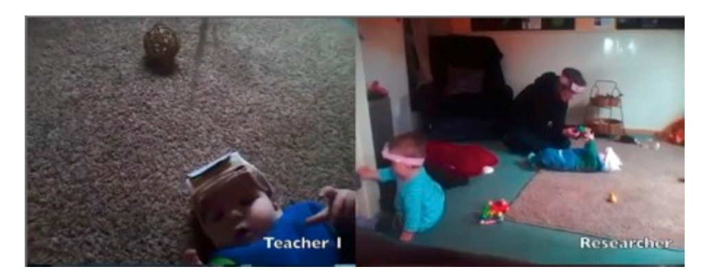
Word + touch + offers object teacher initiation x body movement + sounds + receives object infant response

Key teacher verbalizes: "Heeey, whaaat, I have to go and look what the time is, yes I do" to the four-month-old infant as she simultaneously touches his body. She then offers the infant a wooden toy. The infant waves his arms and legs whilst making "ouh aah" sounds in response. He receives the toy.