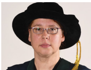
Head of Computing and Mathematical Sciences