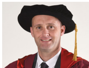
Executive Head of School, Management

BSc (Hons) (Glos), PGCTHE (Oxford), PGDip (Glos), MA (Cardiff Metropolitan), PhD (Gloucestershire)