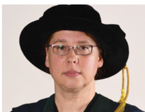
Head of Computing and Mathematical Sciences