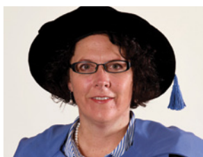
Dean of Science

BEng (Hons) (SBankPoly), PhD (SBank), AgriTech NZ