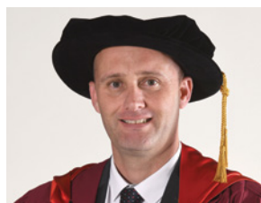
Executive Head of School, Management

BSc (Hons) (Glos), PGCTHE (Oxford), PGDip (Glos), MA (Cardiff Metropolitan), PhD (Gloucestershire)