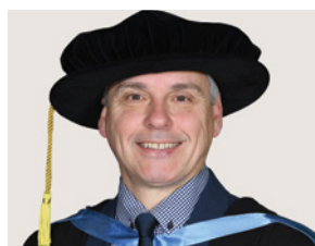
Dean of Engineering