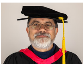
Head of Design

Dipl Math Techn Tu, PhD FU (Berlin), PGCertTT (Waikato)