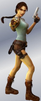
Lara Croft – Tomb Raider

“Although gender representation has altered during the last decade, game developers openly state that their rationale for the inclusion of female characters is based upon the premise that they appeal more to the average boy gamer than an equivalent male character” (Schott and Horrell 2001, 37)