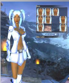
(Guildwars elemental avatar)